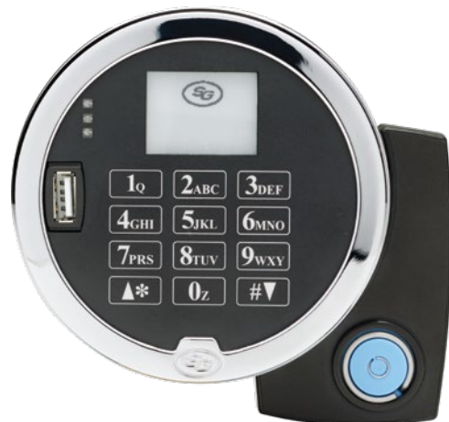
A-Series™ with display